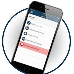
One touch calls your Provider Law Firm or gives you emergency legal access